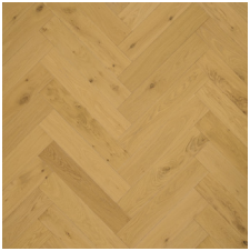
San Antone 4-3/4" NWEK809W