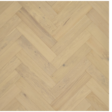
Winter River 4-3/4" NWEK859W