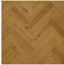
Rio 4-3/4" NWEK829W