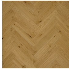
Pecos 4-3/4" NWEK839W