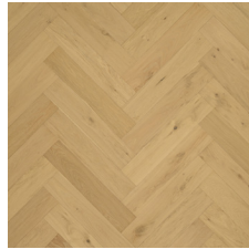
Eleven Point 4-3/4" NWEK899W