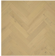
Warm Fork River 4-3/4" NWEK889W