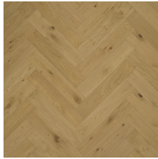
Osage 4-3/4" NWEK819W