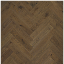
Little Black River 4-3/4" NWEK869W